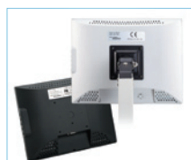
VESA Wall Mounting 75x75mm Meet Vesa Standard