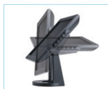
Stand Base (0°~90°)