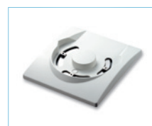
Add-on Base Swivel 56° from Left to Right