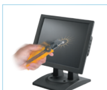
Anti-Reflection Strengthen Glass